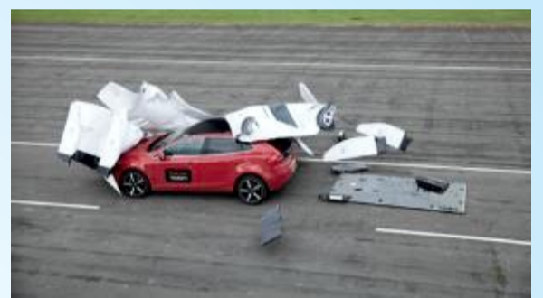
AEB (CCRs, CCRm)